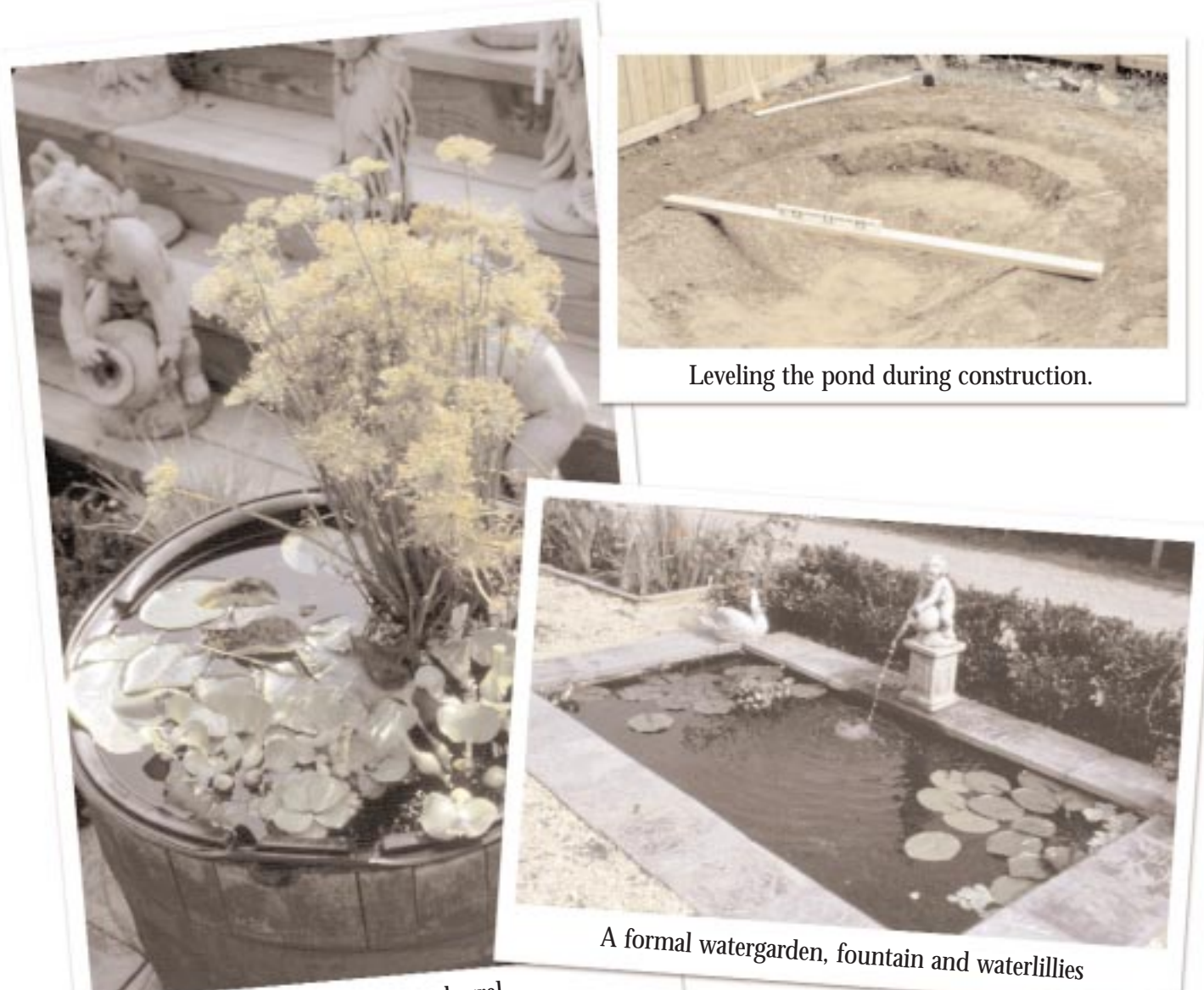
Water garden in a barrel.